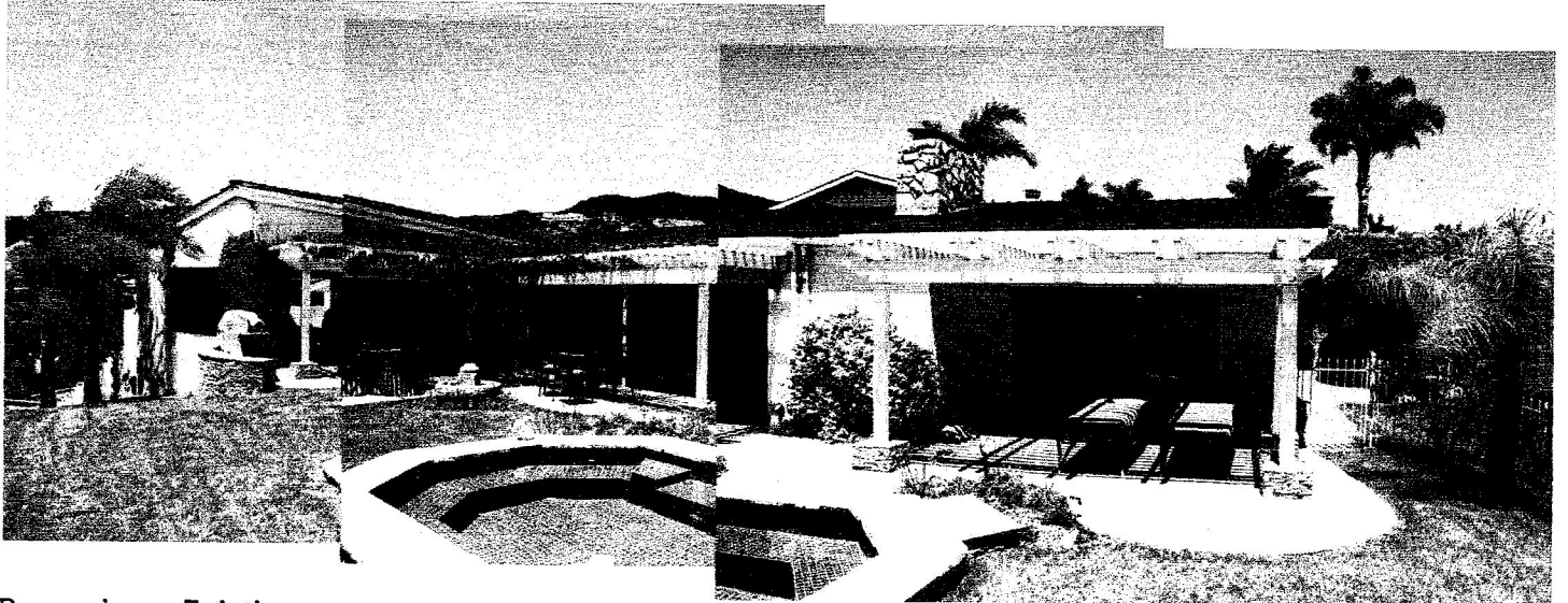
Rear view- Existing