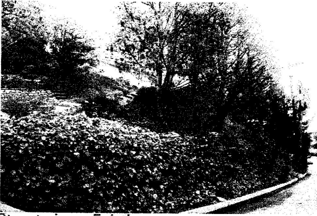
Street view- Existing

Leigh Silverton 1020 Las Lomas, Pacific Palisades, CA