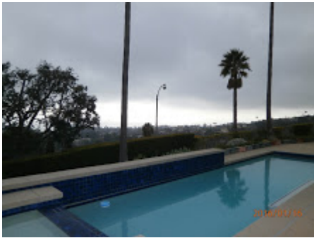
View from 1348 Las Canoas - Across the Pool- Lowered ObDeck.jpg 530K