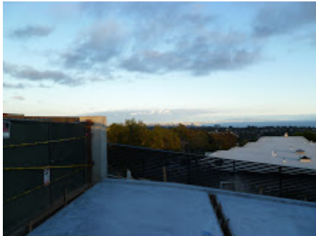
2017 5-25 gate closed.jpg 1483K